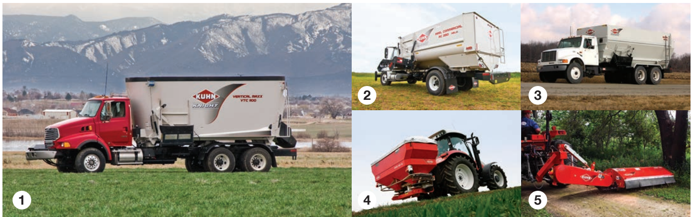
1. Vertical Twin-Auger Mixers – 2. Reel Mixers – 3. 4-Auger Mixers – 4. Fertilizer Spreaders – 5. Roadside Mowers

With over 690 models of equipment, we have the most complete implement line in the industry. Whether you have a small or large operation, we have a broad range of models and options to help fit your diverse needs.